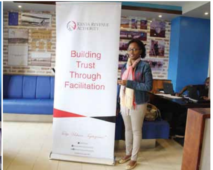
KRA assisting 748 staff in filing their returns

Earlier in June, 748 Air Services collaborated with Kenya Revenue Authority to educate staff on filing their tax returns.