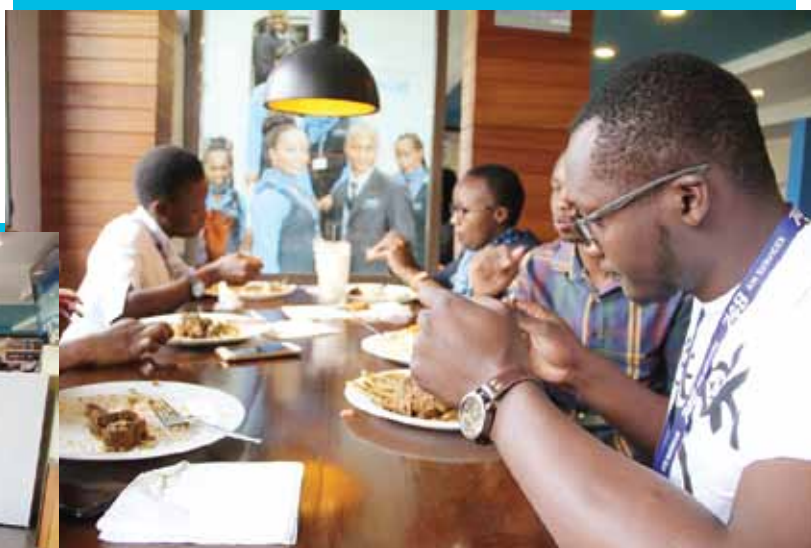
748 staff enjoying Eid Celebration

The celebrations took place at Café 748.