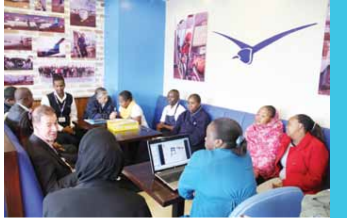
748 staff attending Medical awareness programme.

On 3rd August, 2017, a medical awareness programme with our health provider was organized. The programme provided a platform whereby all staff were educated on health related issues.