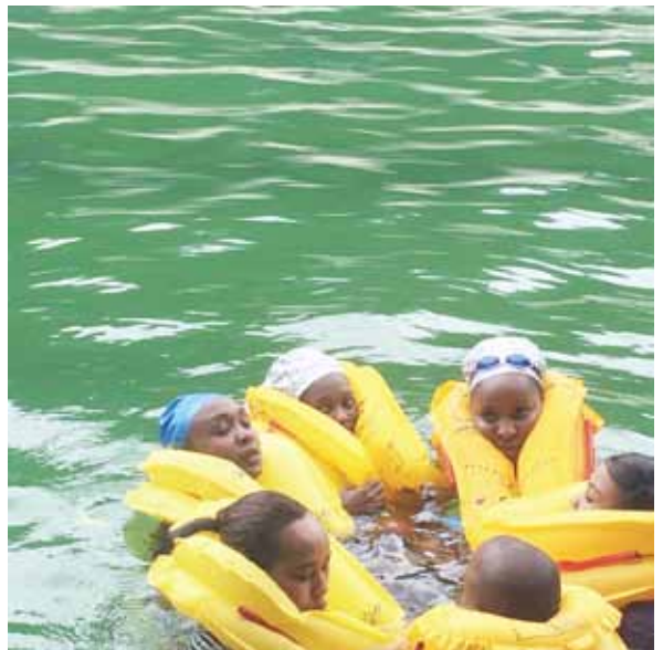
748 cabin crew undergoing the ditching exercise.

Indeed these are strides that 748 Air Services undertakes to ensure that it provides a world class service without compromising on safety and quality.