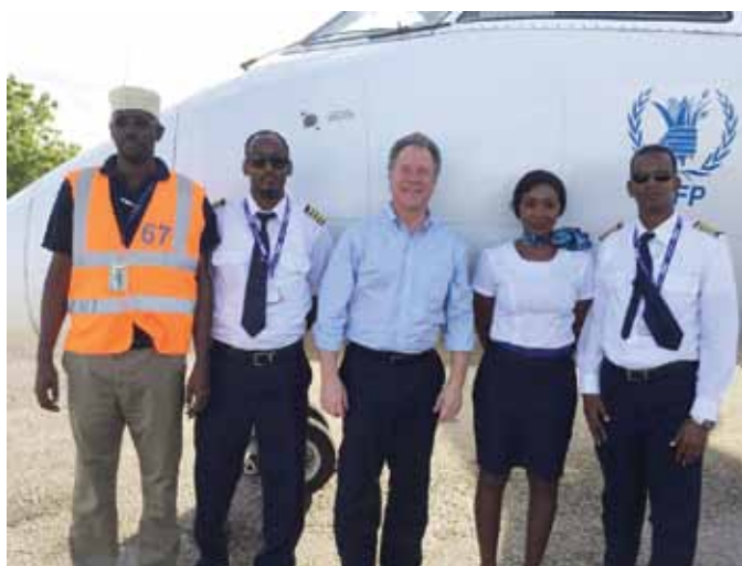
WFP Executive Director, David Beasley posing for a photo with our crew.

We are privileged and honored to have been the carrier of choice for the WFP Executive Director, David Beasley on a mission to Somalia, in May 2017.