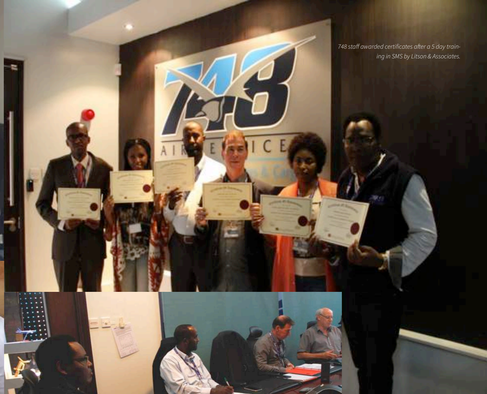
748 staff awarded certificates after a 5 day training in SMS by Litson & Associates.