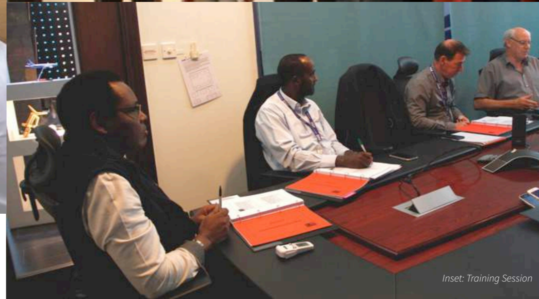
Inset: Training Session